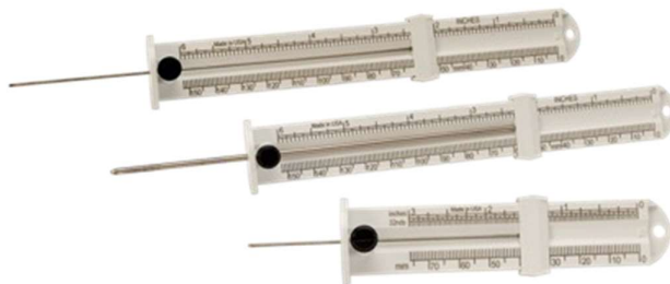
Figure 5: Pin Depth Gauge