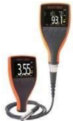
Figure 4: Electromagnetic Depth Gauge

Preference should be given to non-destructive methods to minimize the risk of damage to the system.