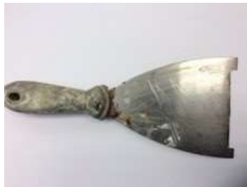
Figure 3: Example of a notch gauge

Wet film thickness should be measured regularly during application using a pre-cut bridge gauge, typically made from a scraper; gauge widths of between 40-100mm (1.5-4.0”) have been found to be most appropriate. The gauge is placed into the wet material pressing down to the steel substrate or previous cured layer of PFP and when a line is left in the surface of the wet material the required depth has been achieved. We do not recommend the use of notch or pin gauges as they limit the measurement to one point.