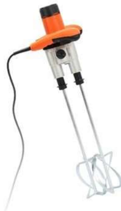
Figure 2: High-torque hand-held mixer

Consideration should always be given to the relevant pot-life and kits should not be mixed until they are ready to be used. For trowel application, it may be beneficial to spread the material out on a flat board to dissipate heat and extend the workability.